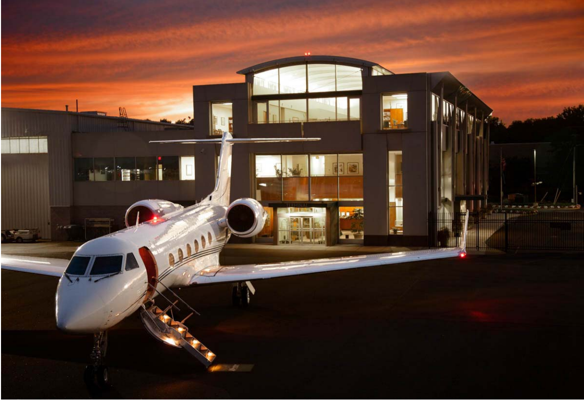
Meridian Teterboro – Ramp View at Dusk